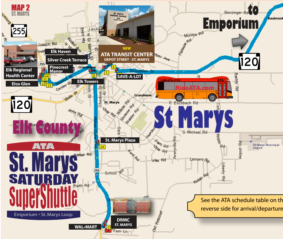
MAP 2 ST. MARYS

See the ATA schedule table on the reverse side for arrival/departure times.