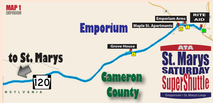
MAP 1 EMPORIUM